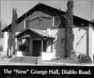
The "New" Grange Hall, Diablo Road.

The Museum of the San Ramon Valley is located at 205 Railroad Ave., Danville and is open from 10-1 Tues.-Sat. for July and August (summer hours). For information call 925-837-3750. (museumsv.org) A museum store offers unique gifts. During July and August Depot Days at the museum provide model trains, railroad exhibits, story hours and special programs for families.