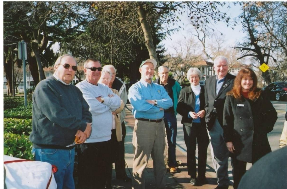
Members listen to the presentation